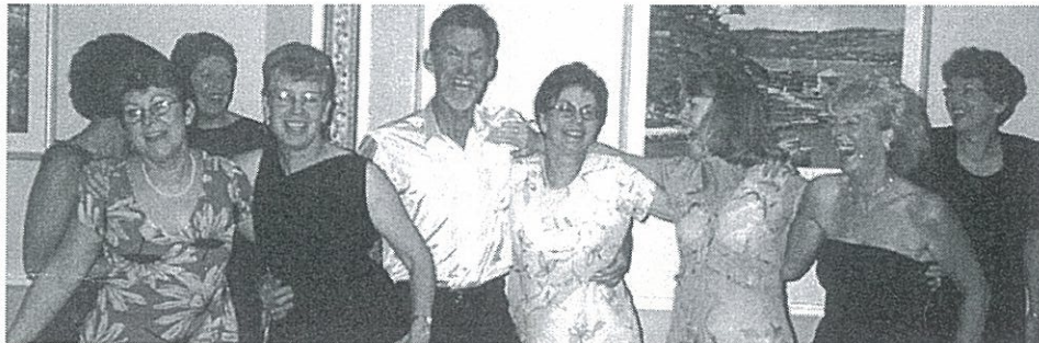
A good time was had by all at the annual dinner dance.