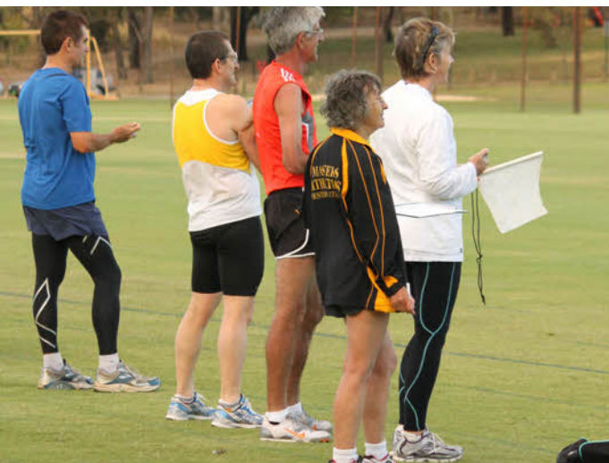
Where would we be without athletes helping out with timing and recording.