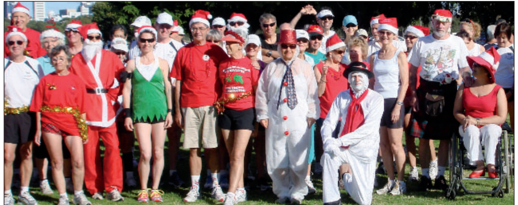
Mob finish at the Christmas Gift Run: most contestants felt fresh, although Frosty the Snowman was melting to his knees. This was a self-handicap event in which tripping over your long white beard is considered a fair outcome.

"We know that some track athletes have a preference for running at WAAS," said