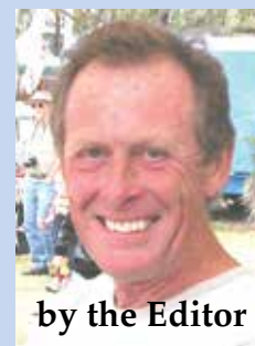
by the Editor