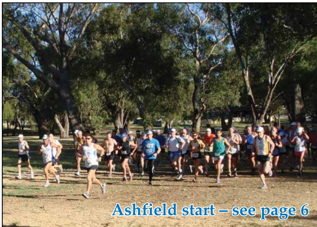
Ashfield start – see page 6