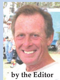
by the Editor