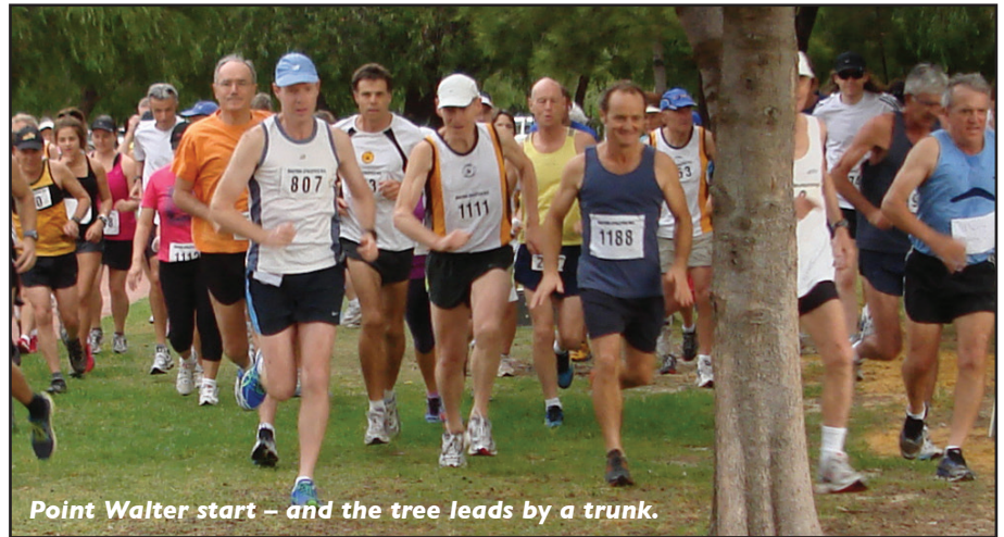
Point Walter start – and the tree leads by a trunk.