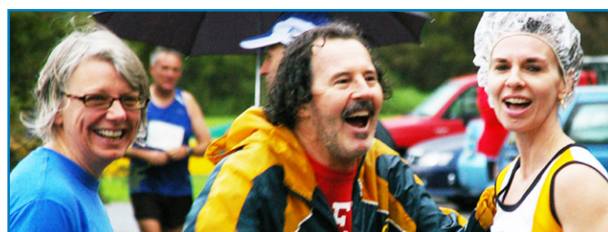
Who says accounts are dull?

NOTE: the above financial statements are subject to audit.