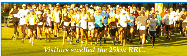
Visitors swelled the 25km RRC.