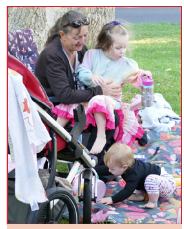
Helpers - always appreciated!