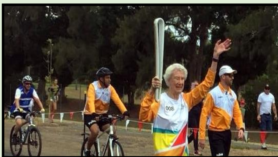
Queen's Baton Relay some of the masters athletes represented